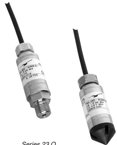
Series 23 Q